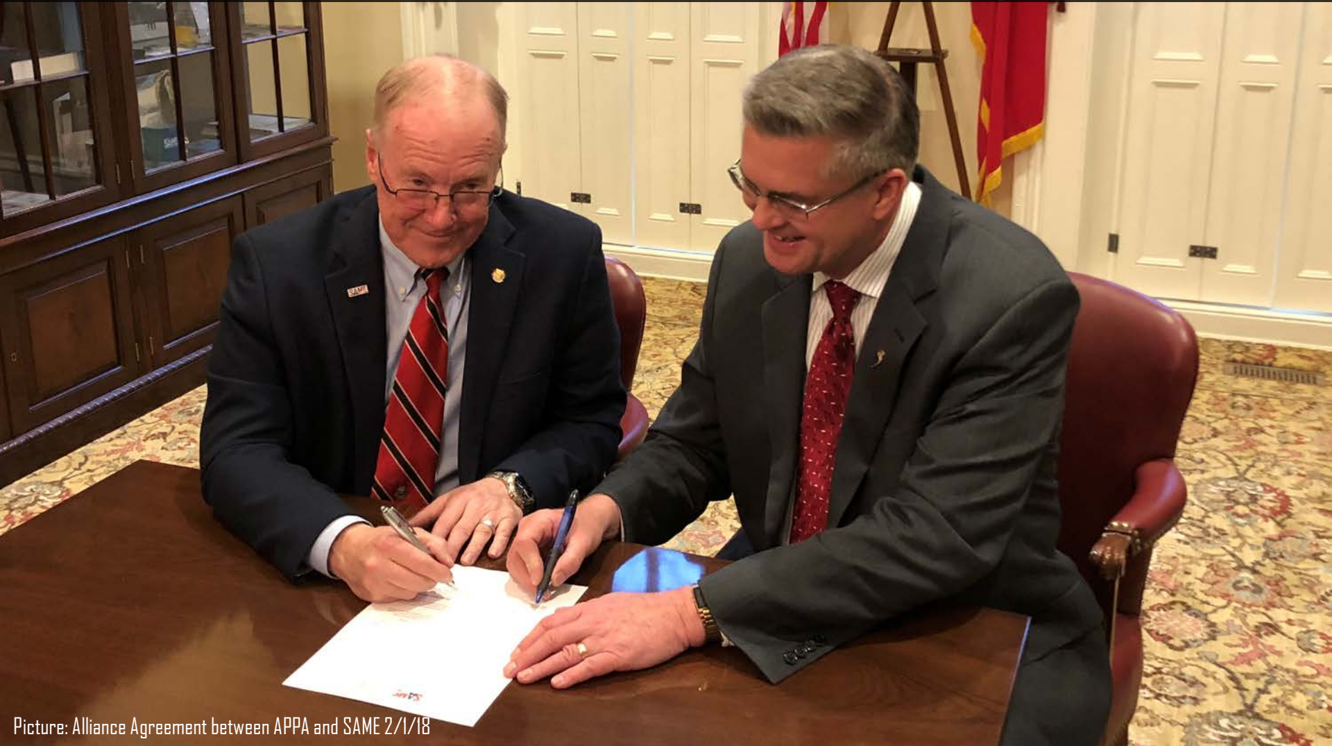
Picture: Alliance Agreement between APPA and SAME 2/1/18

ACUHO-I, ASHE, ASHRAE, AUDE, CampusERC, CHEMA, HEFMA, IDEA, NACUBO, PGMS, SAME, TEFMA